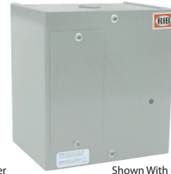
Shown With Cover

* Move internal jumper to "HOT" position if you wish outlets to always be hot otherwise outlets will be switched by main breaker.