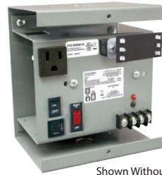
Shown Without Cover